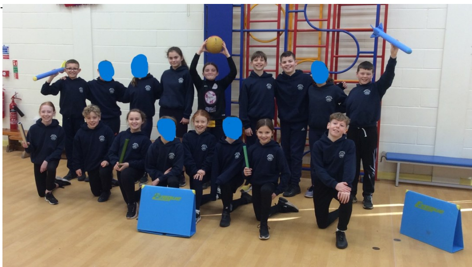
Congratulations to our Y5 & Y6 Indoor Athletics Team who won their qualifying event at Leeds Trinity on Monday. The next stage of the competition will take place in late February.

Click below to see what has been happening in your child's class this week: