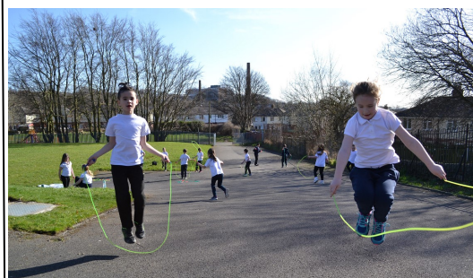
3/4 Cedar 'Skipping for Boxing'

It has been ' School Games ' week and our children have enjoyed a variety of activities in their PE lessons! The purpose was to reconnect the children and re-engage them back into PE and physical activity. Each class was given a choice of 5 activities: Ping Pong, Ultimate Frisbee, Street Dance, Skipping for Boxing or Cricket. It was great to see all pupils back in school doing some physical activity with a smile on their face!