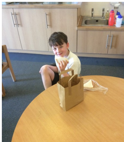
Lunchtime in the classroom