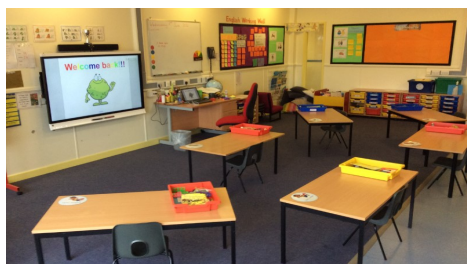
Y1 before re-opening